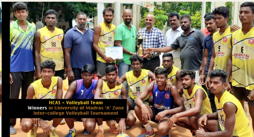
HCAS - Volleyball Team Winners in University of Madras 'A' Zone Inter-college Volleyball Tournament